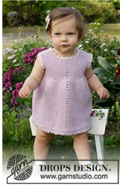
DROPS Baby 38-3

Needle size is only a suggestion! If you have too many stitches on 10 cm switch to a larger needle size. If you have too few stitches on 10 cm switch to a smaller needle size.