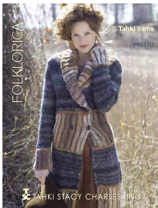
FOLKLORICA , featuring 6 knit designs in Presto