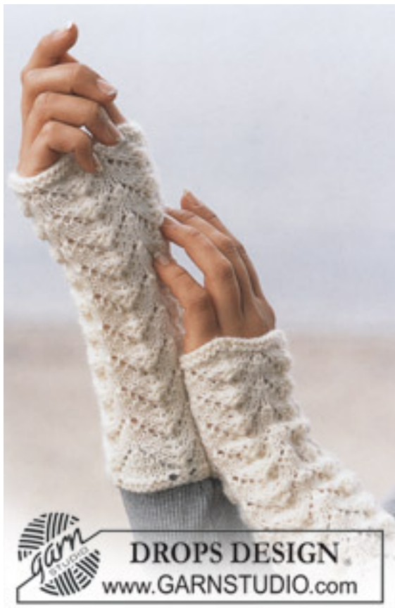
DROPS number 86-3