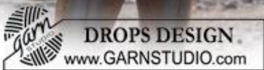
DROPS n° 80-1

990A Shoppers Row Campbell River, BC, Canada V9W 2C5 250-287-8898 or 1-888-588-7834 info@needlenart.com www.needlenart.com